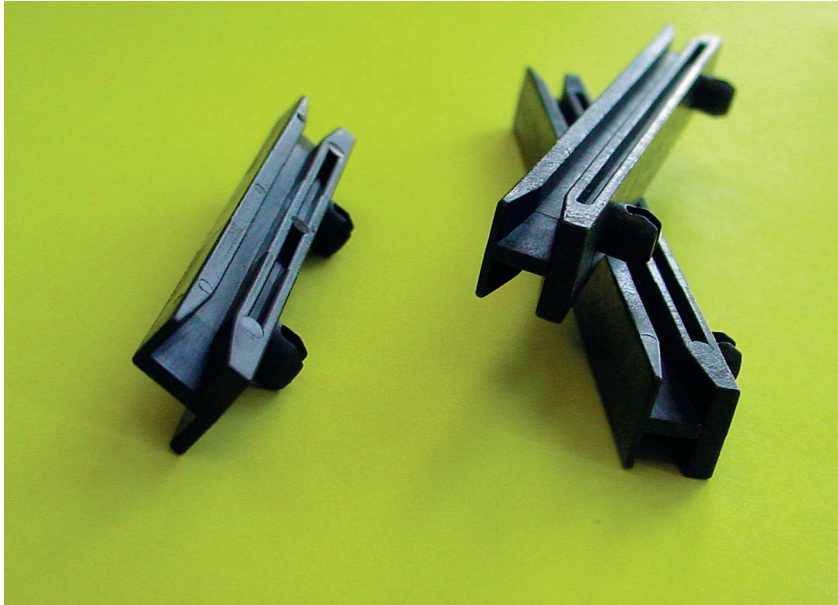
SINGLE AND DUAL SIDED HORIZONTAL CARD GUIDES